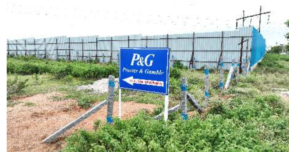
PROCTER & GAMBLE