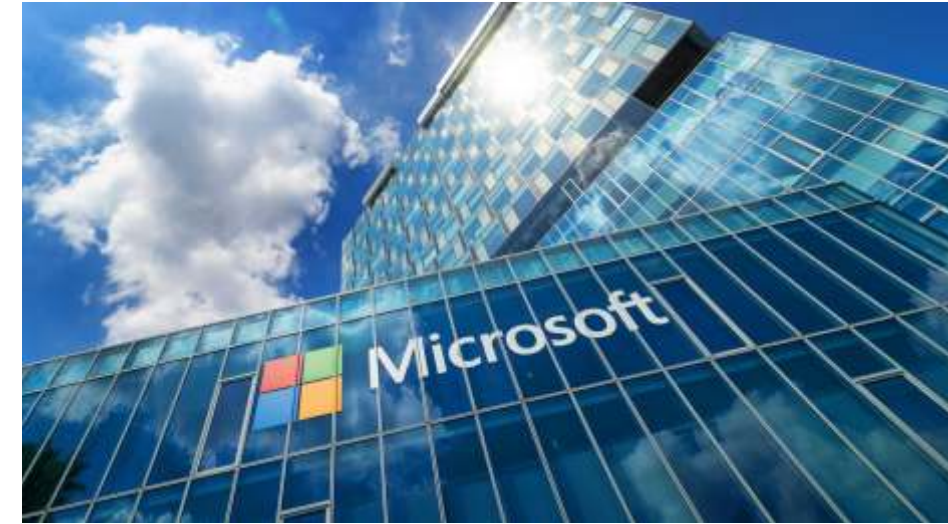
MICROSOFT DATA CENTER