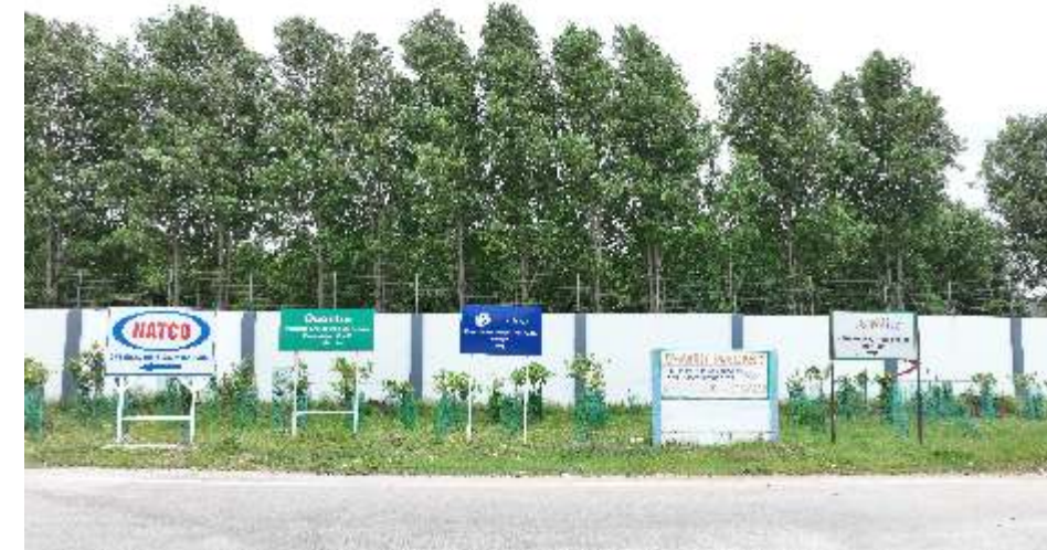
NEAR BY COMPANIES