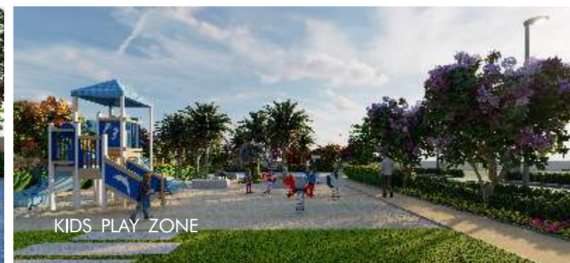
KIDS PLAY ZONE