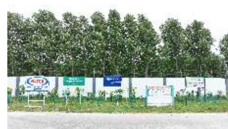
NEAR BY COMPANIES