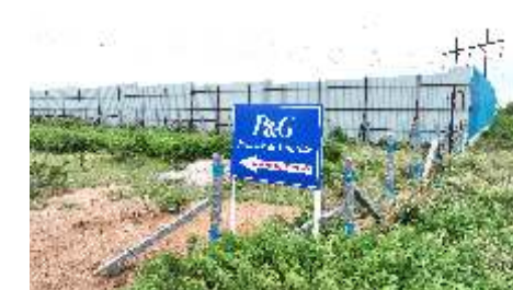
PROCTER & GAMBLE