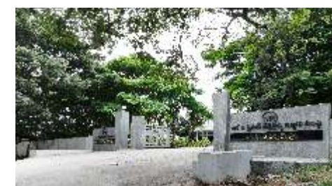
L.V.PRASAD EYE HOSPITAL